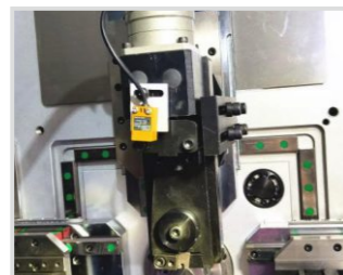
Servo Scissor 伺服剪刀