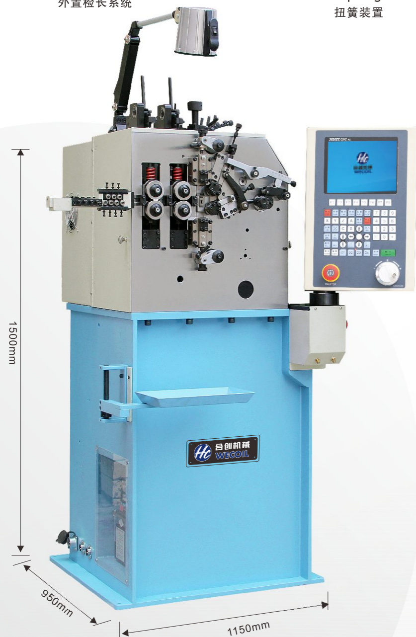
Torsion spring device 扭簧装置