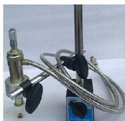
External/Internal spring length gauge 外置/内置检长系统