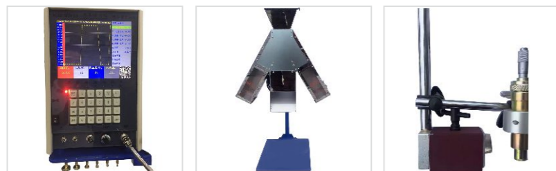
External/Internal spring length gauge 外置/内置检长系统

6 Axis CNC High-speed Spring Coiling Machine